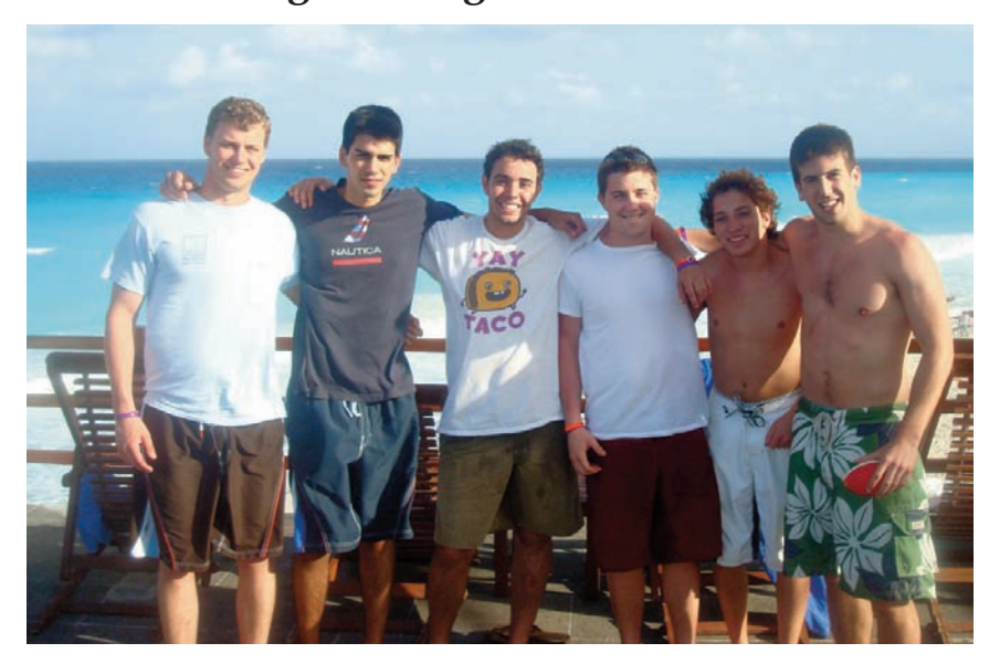
Several Tri-Kap '10s enjoying spring break in Cancun together.

The Spring of 2009 saw a continuation of our vibrant and cohesive brotherhood, as Tri-Kap brothers continued to bond over a multitude of in-house and interfraternity programming events.