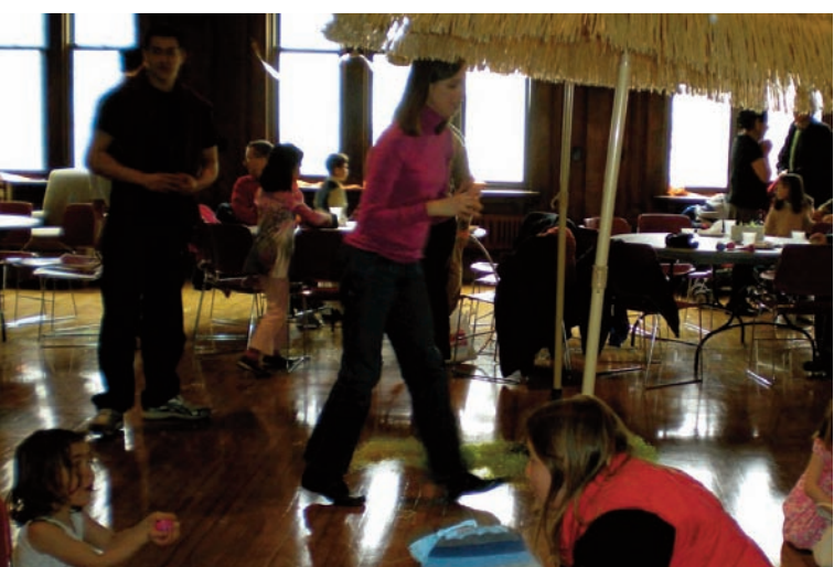
Children in the community enjoy Tri-Kap's community Easter Egg hunt

Games about midway through the term. We were able to help setup and register teams for the opening ceremony and lead them into the march around the track. We then helped out in the swimming events by timing the contestants and providing