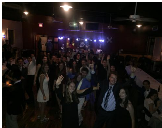
Above: Fall formal at the Engine Room

While the brotherhood did not have a winter formal (in anticipation of going all out in the spring), fall formal was a blast. The Engine Room, a co-working space tucked into the back roads of White River Junction, hosted the brothers and their dates for an evening of dancing, drink, and debauchery. Some 25 brothers and their dates attended the event. We look forward to returning to our favorite spring formal spot, Lake Morrey, to send off our graduating seniors.