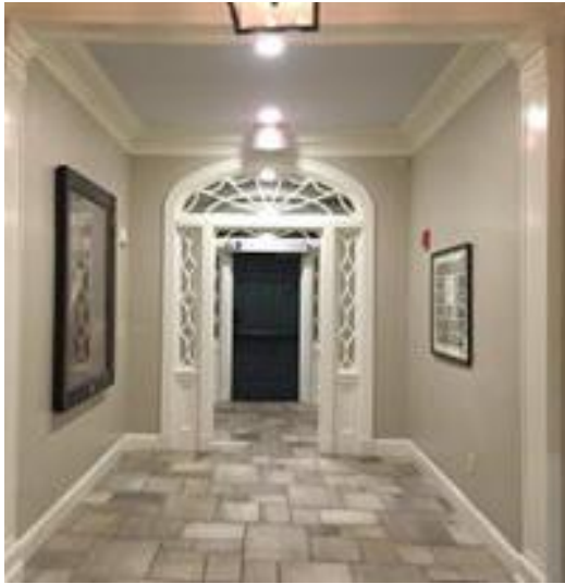
This Page: The Entryway (top left), Great Hall (top right), Beach (middle left), GOTE (middle right), Kitchen (bottom left), 2 nd floor (bottom center), and bathroom (bottom right)