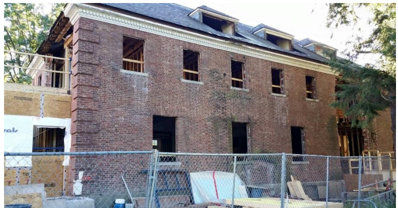
Above: The North side of the house