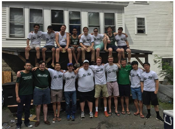
The summer brotherhood gathered behind the off-campus house at 14 WestWheelock.

Please pay your alumni dues at http://trikap.com/AlumniDues or by writing a check to Kappa Kappa Kappa Society and mailing to Terry Lowd '66 , P.O. Box 124, New Harbor, ME 04554